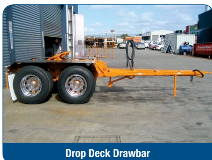
Drop Deck Drawbar